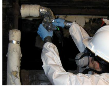
Haz Building Materials