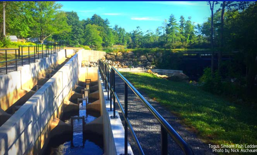
Togus Stream Fish Ladder

KVCOG believes strongly in conservation and resilience efforts and is thrilled to be a part of this important project. ⚙️