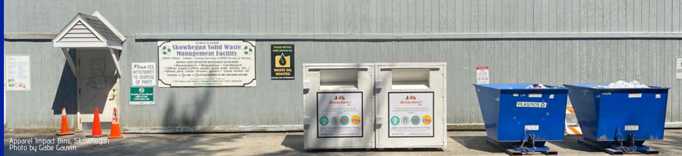
Apparel Impact Bins, Skowhegan