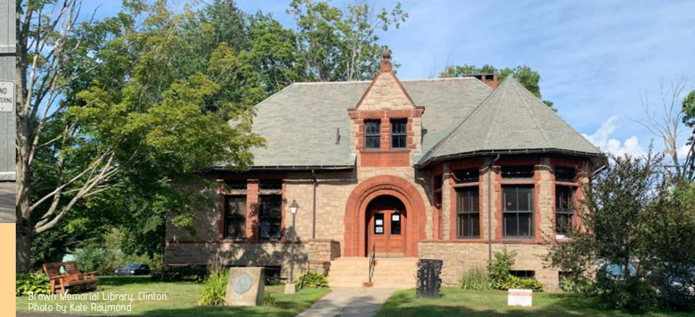
Brown Memorial Library, Clinton