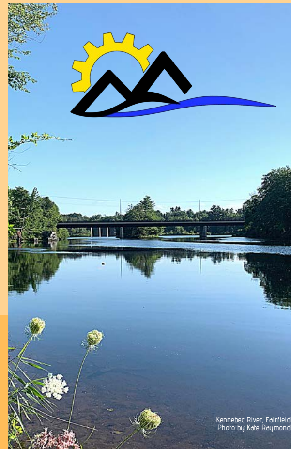
Kennebec River, Fairfield

*An interactive map showing all twenty+ collection points in the KVCOG's region is available on the Kennebec Valley Council of Governments website here: www.kvcoq.org/collection-points